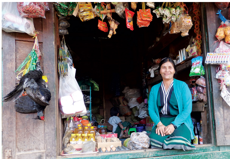
Chin lady at her small grocery shop in Mindat

Located on Myanmar's western border, Chin State is the second smallest State/Region in Myanmar. With a population of 478,801 (2014 Census data), Chin State is also one of the least populated states/regions with sparse settlements in hilly areas. In term of topography, entire region of Chin State is located within mountain ranges with most towns and villages sitting 5,000-7,000 feet above sea level. Its mountainous terrain makes