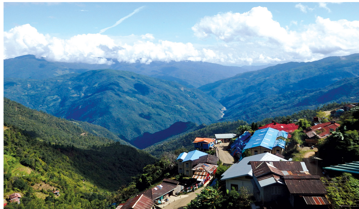
Overlook of part of Falam Township

Moreover, a more concrete division appears to exist between Northern and Southern Chin groups. Several factors contribute to this. Firstly, the dialects between North and South are mutually unintelligible, despite the fact that the sub-groups are all classified as being 'Chin'. Uniting around a common language is seen as necessary by those who strongly advocate a federal state, and yet deciding which language would be prioritized as the State's language stands as a major challenge. One interviewee suggested Mizo language (the Chin dialect spoken in Mizoram State, India) be adopted as the common language for all Chin groups mainly for the reason that textbooks and curriculums for those languages are already established. Due to poor transportation links, not a lot of interactions between different sub-groups exist,